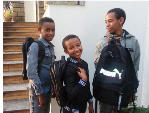
Students get their back to school materials