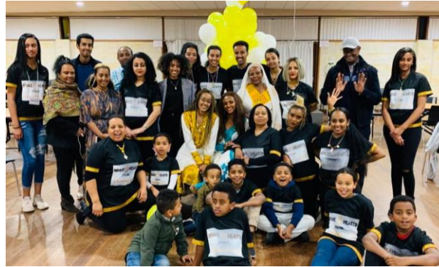
BHE Australia holds fundraiser and awareness event

Summer activities included book reading, computer, Math and English tutorials to boost the children's studies while engaging them in creative activities at our drop in center. The children also received new cloths and bags for the academic year ahead.