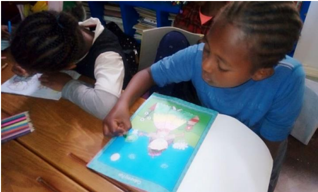
Children engage in fun and educational summer activities

Summer activities included book reading, computer, Math and English tutorials to boost the children's studies while engaging them in creative activities at our drop in center. The children also received new cloths and bags for the academic year ahead.