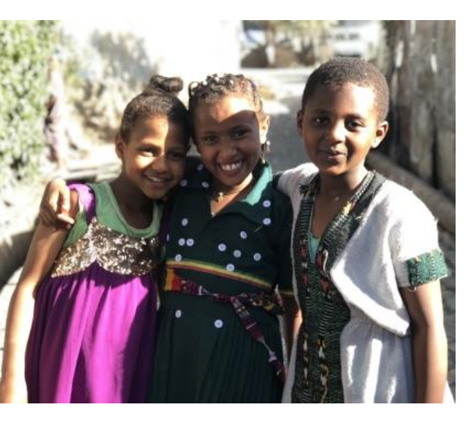
Support BHE on GlobalGiving!

https://www.globalgiving.org/pr ojects/quality-education-fororphan-and-vulnerable-children