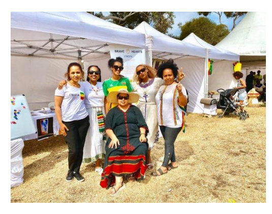
BHE Australia board and volunteers raised awareness at the Ethiopian Soccer Tournament

See the following pages for these stories and more of our report.